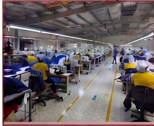
SEWING FLOOR 1