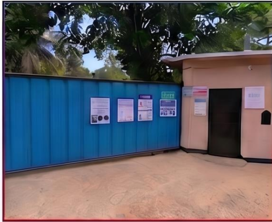
MAIN GATE & SECURITY