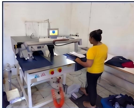
AUTOMATED SEWING 1