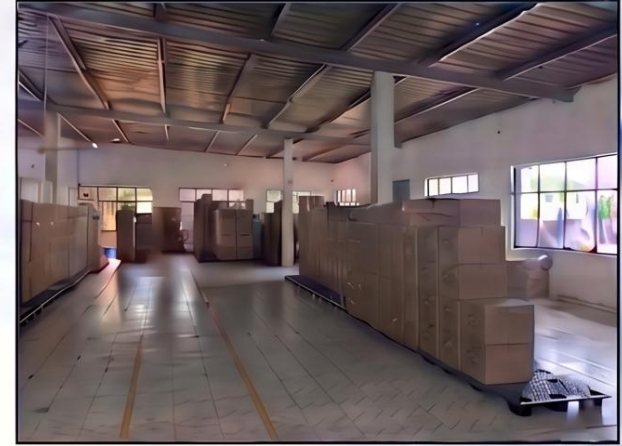
FINISHED GOODS STORAGE