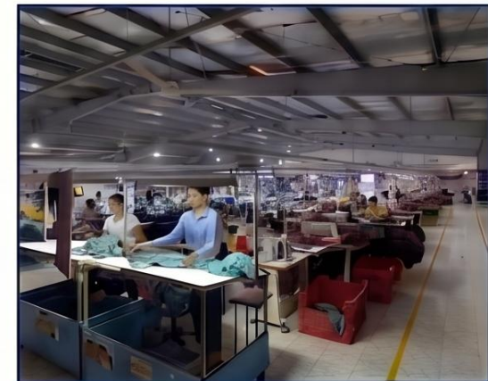
SEWING FLOOR 2