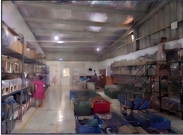
WAREHOUSE & STORAGE