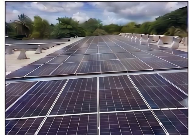
ROOFTOP SOLAR ENERGY