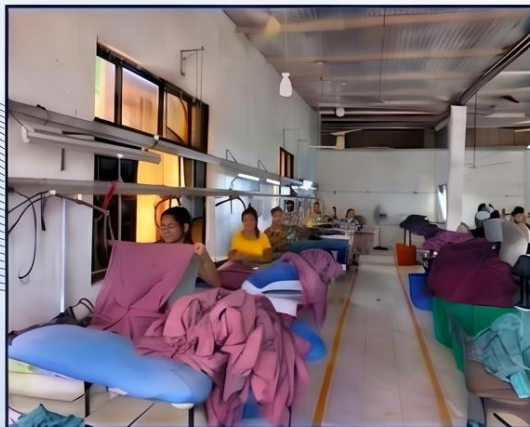
FINISHING & PACKING