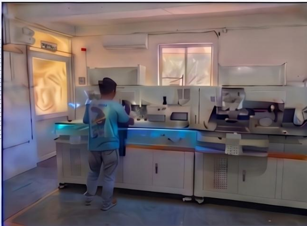
AUTOMATED SEWING 2